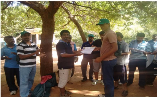
Participant receiving certificates

year Mechanical Engineering attended SAEINDIA TREK PROGRAM Conducted by SAEINDIA at PET Engg. College on 01st and 02nd of Aug, 2015.