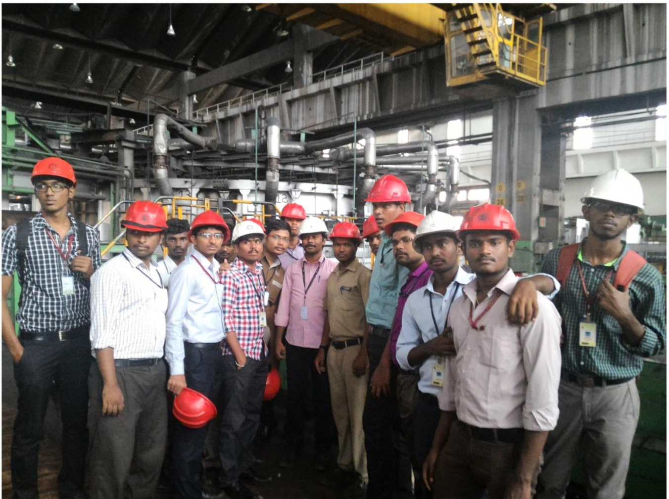
Students in Bangalore Rail Wheel Factory

Industrial Visit enhances the students about different roles and importance of Mechanical Engineer.