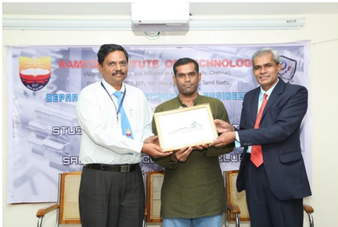
Releasing SAE- RIT Collegiate Club Logo

The department's association was inaugurated with the name of RIT - MECHANIZO and the club for SAE was started as "SAEINDIA- RIT Collegiate Club" on