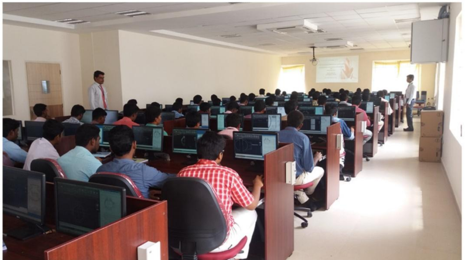
The Second year students attending Autodesk Autocad 2015

One week value added course—AUTODESK AUTOCAD 2015 for mechanical II year “A” section students was conducted during 07.12.2015 to 12.12.2015 in mechanical CAD-Laboratory by