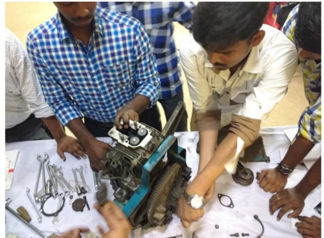
Student undergoing hands on experience