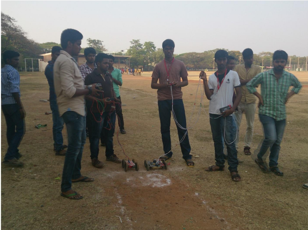
Students competing at Anna University Chennai