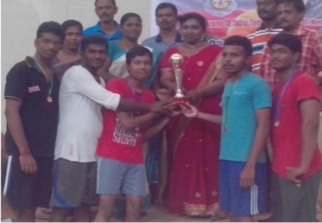
Winners of Table Tennis Tournament

have won at Table Tennis Tournament in Chennai Conducted by Anna University on 10 th & 11 th August, 2015.