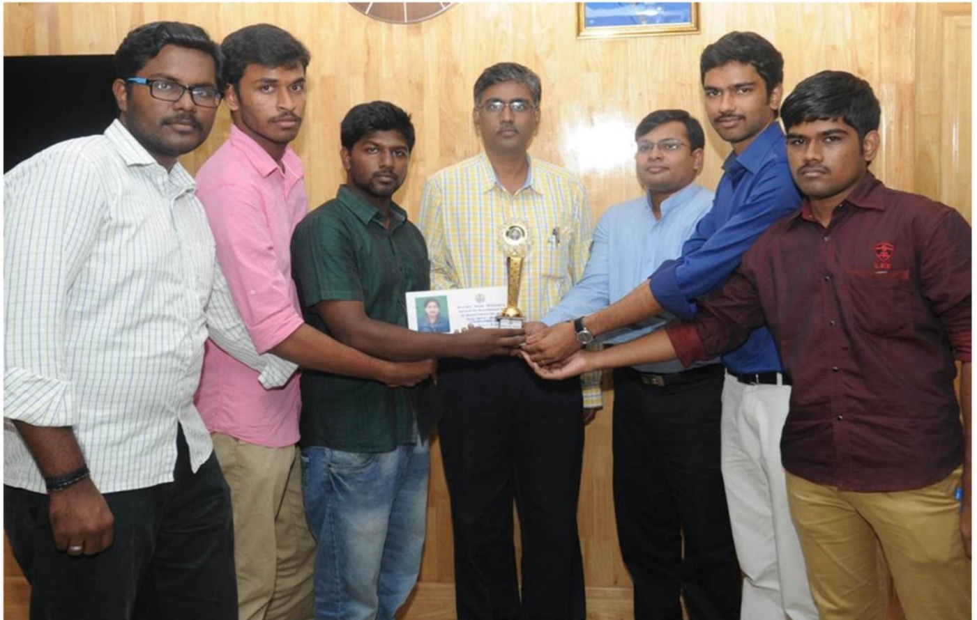
Receiving Cash prize with certificates from Virudhunagar District Collector

project Title: TARS (Tamil Nadu App for Ration Shop).