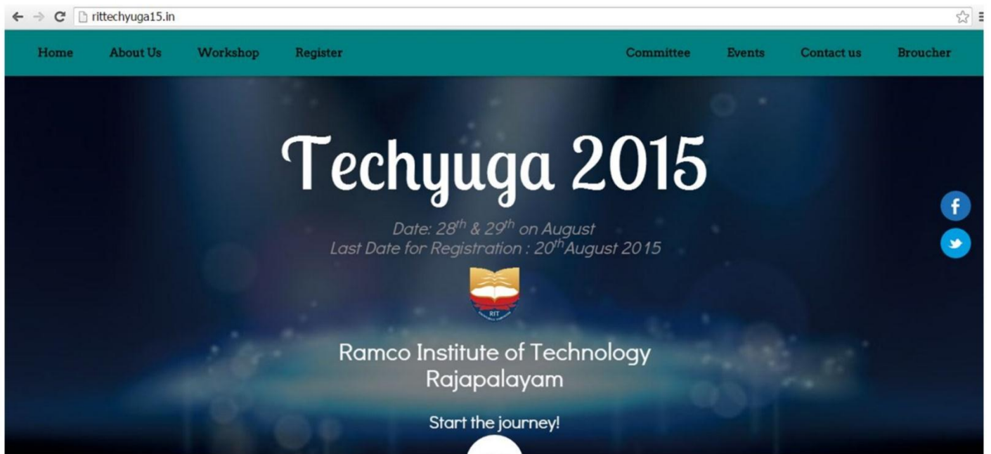
Official website of the Techyuga'15 Main Page