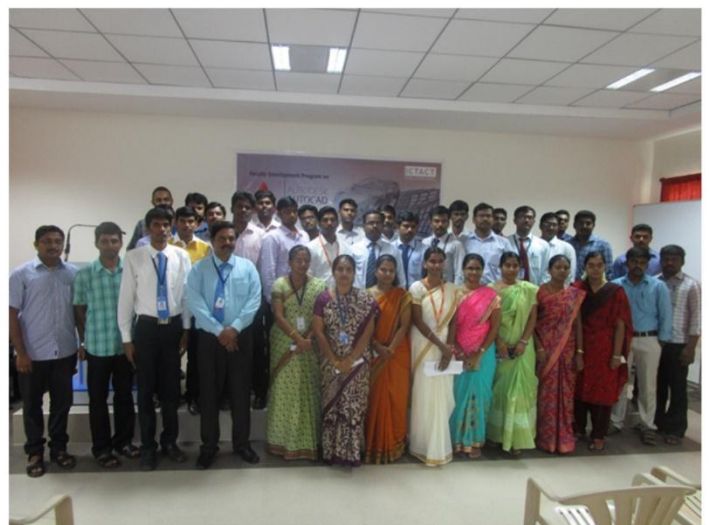
Faculty participants for the development program

Faculty Development Program on Autodesk AutoCAD 2015 was conducted from