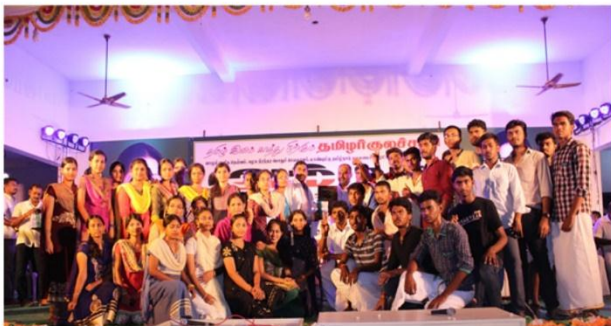
Student Participant who participated in cultural event

Mechanical Engineering Students have actively participated in Cultural Competition at SRNM College, Sattur on 21 st Feb, 2016.