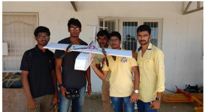
Participants with the Aero model