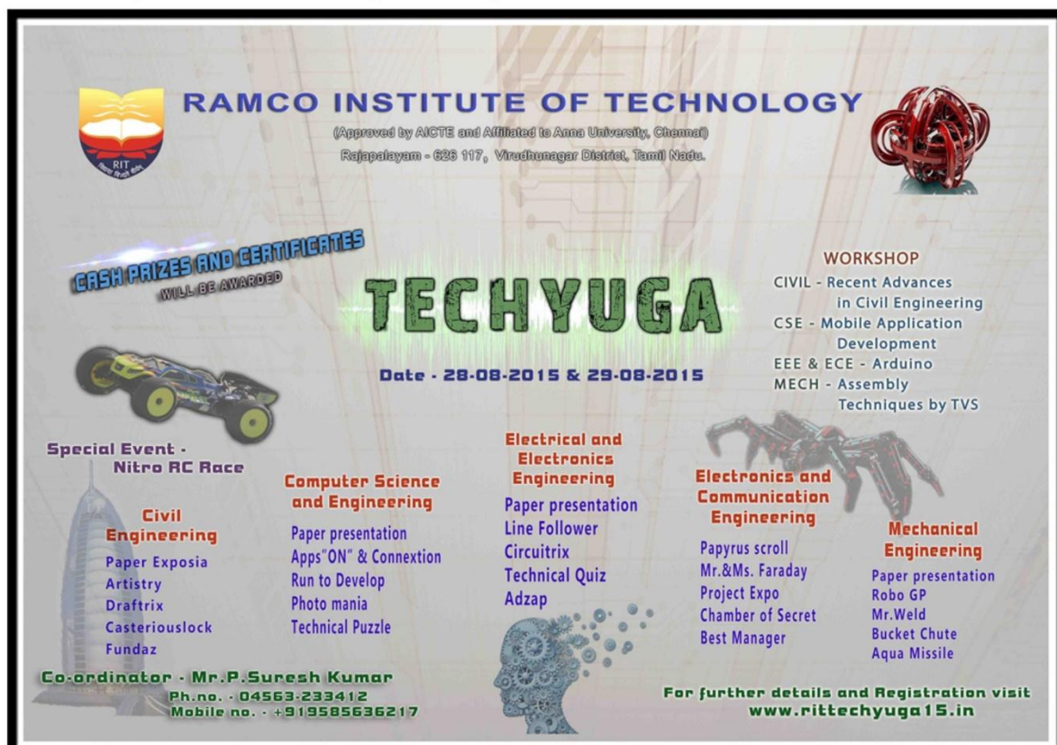
Official Poster of the Techyuga'15