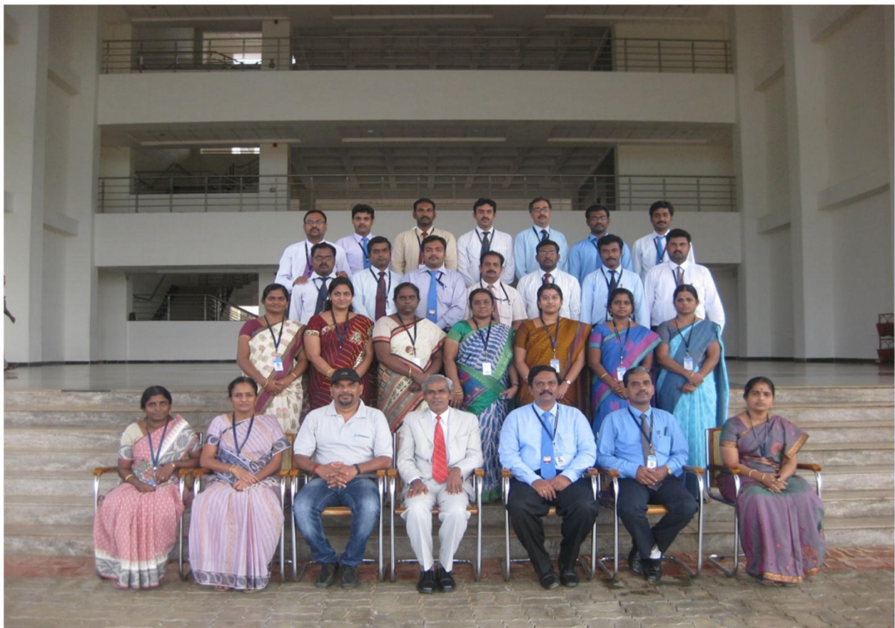
The Faculty Participants who attend ISO awareness program