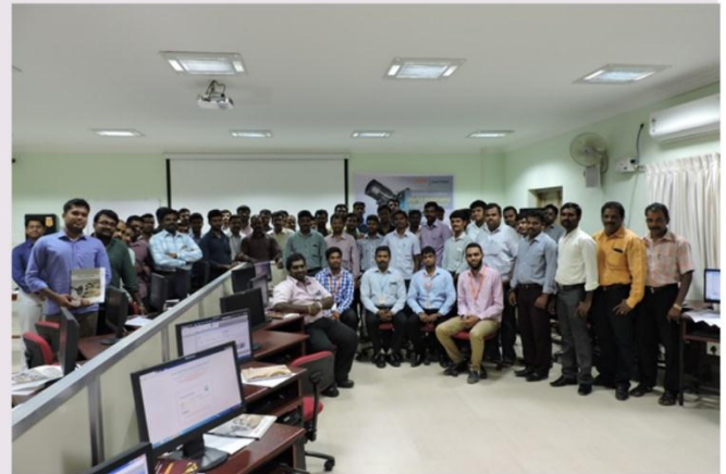
Faculty attended the program

2015” organized by ICTACT on 23 rd Jan, 2016.