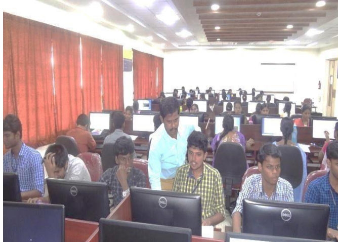
Trainer Giving Hands-on Training to the Students on Java Programming