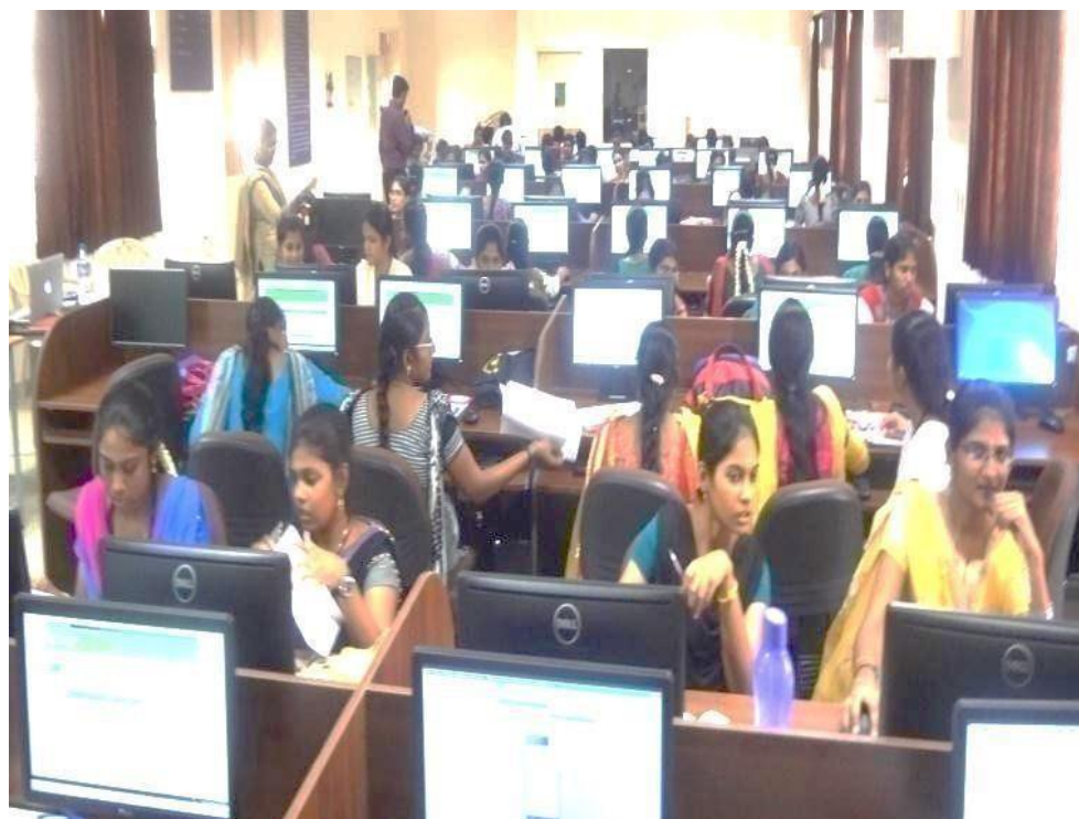
Students Attending the Workshop on Android