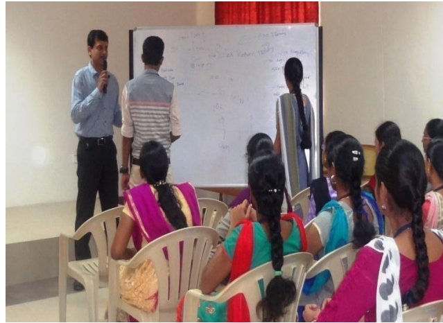
Chief Guest Lecturing about Software Development