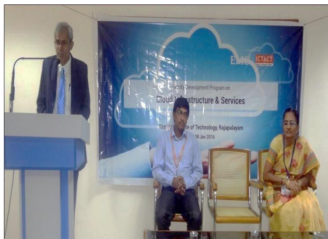
The Principal Delivering Inaugural Address