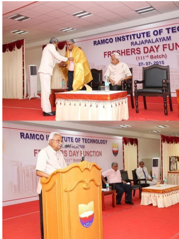
(Chairman addressing the gathering)