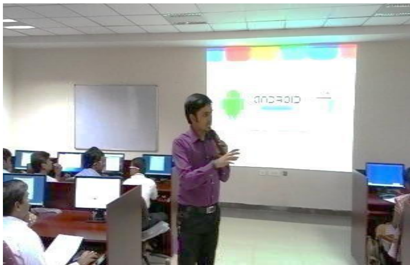
Chief Guest lecturing on Mobile Application Development and J2EE Tools.