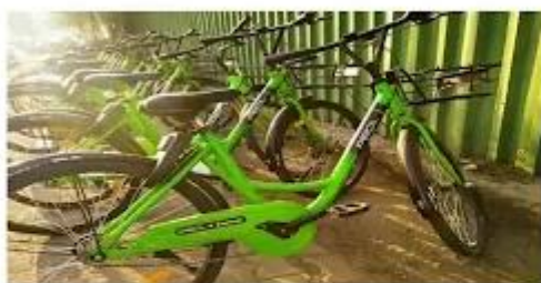
Example Deployment – Smart Bicycle