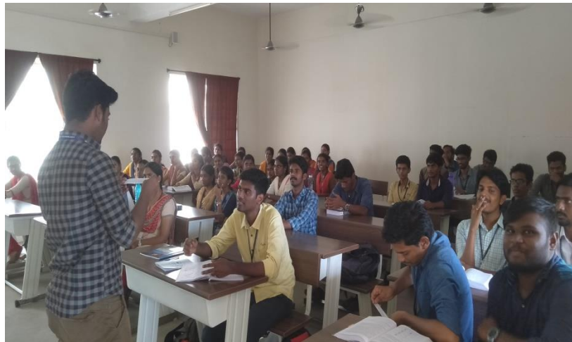
Fig 2: Student form one group discuss the answer to the corresponding question