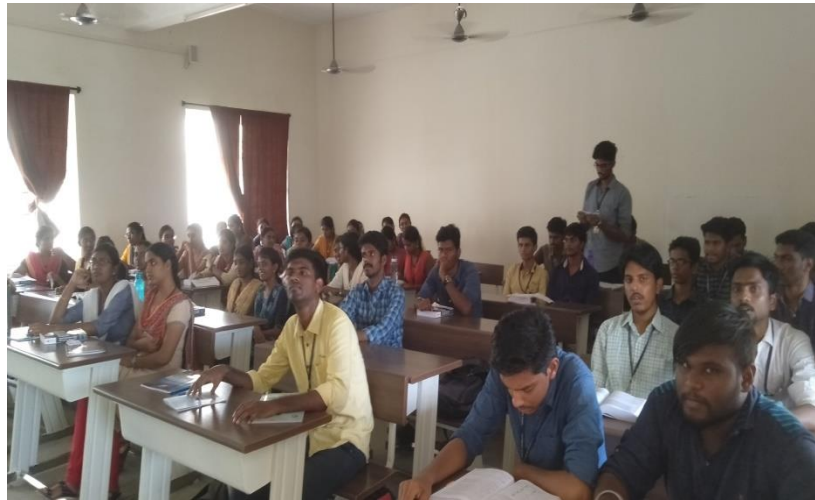
Fig 1: Student ask the Questions to the Class