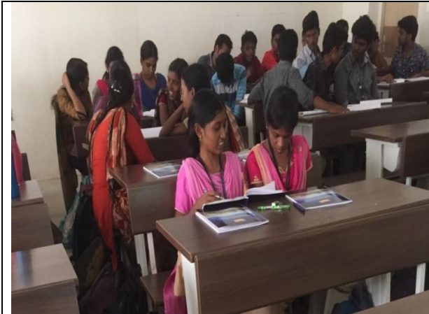
Figure2: Paired the student to share their ideas