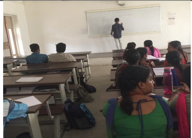
Figure 3: Share the idea into a whole-class discussion